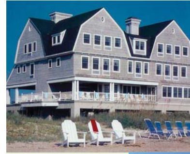
Some HILS sessions are held at the Elizabeth Pointe Lodge in Amelia Island, Florida.