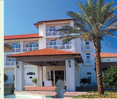
Other HILS sessions are held at the Ponte Vedra Inn and Club in Ponte Vedra Beach, Florida.